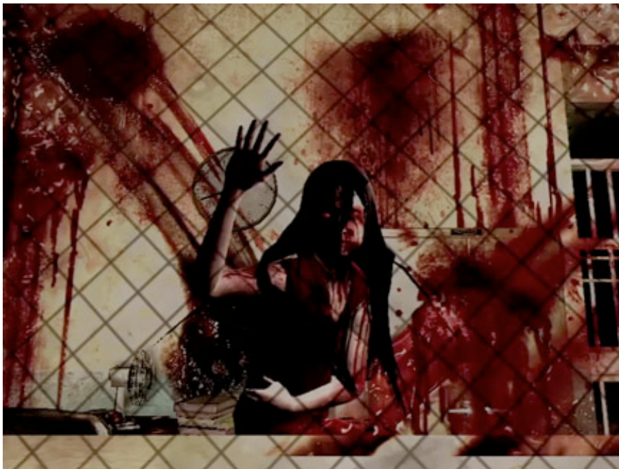
• 'F.E.A.R. 3' Scoring Trailer Trailer