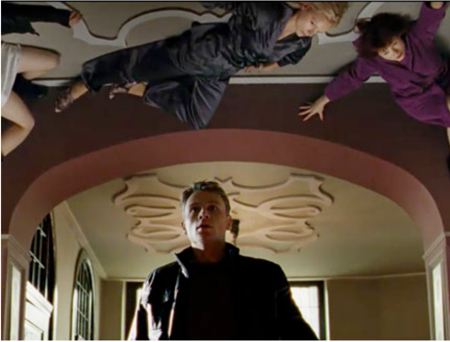
We Are The Night - Trailer