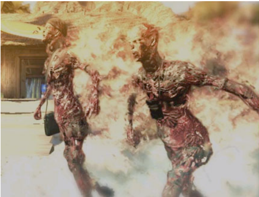
Dead Island - Trailer Trailer