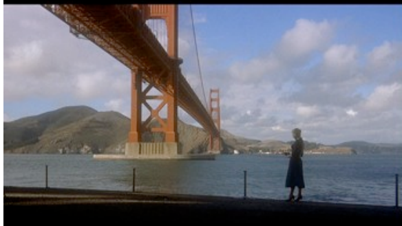
2001 vs. 2008

The new transfer for the Vertigo: Special Edition (Universal Legacy Series) is flawless, with beautiful colors and a sharp picture quality throughout. There is no doubt in my mind that this is the way to go in terms of this movie, and if you've waited seven years for a better quality, at-long-last anamorphic release, you should double-dip without fear. A fairly reasonable retail price also means you won't get dizzy from sticker shock when you take the DVD to the cash register.