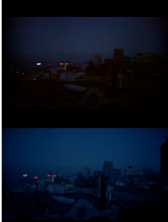
2001 vs. 2008

the 2005 disc, which DVD Savant reviewed at length . He includes quite a bit of information about the restoration of Vertigo and there is nothing here that makes me think this new 1.85:1 anamorphic disc is any different in quality. Still, since the Masterpiece Collection was only available as a boxed set with Vertigo being only one of two improved discs, many of us have not double-dipped. So, I will illustrate the changes with screengrabs below.