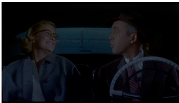
2001 vs. 2008