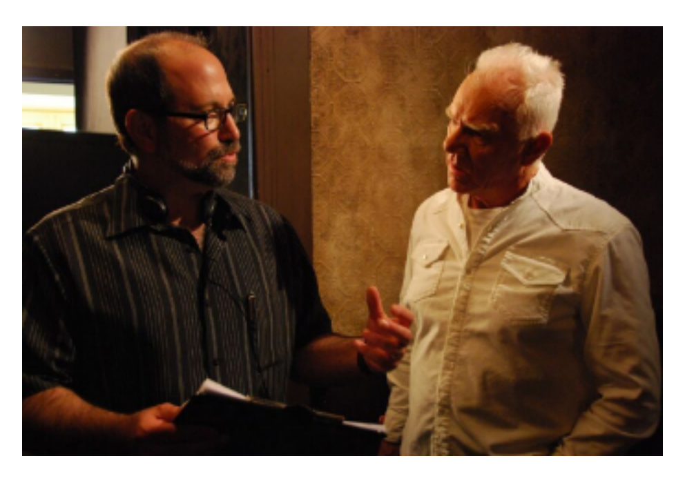
Want to observe A Clockwork Orange from the inside out?