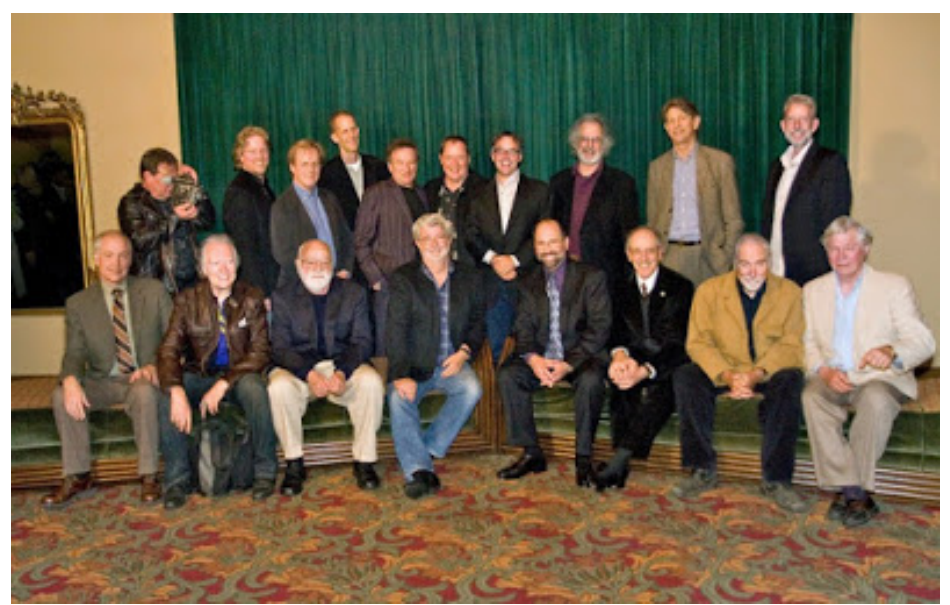
August 2012: The World Premiere of Gary Leva's documentary <u>Fog City Mavericks</u> at the 50th San Francisco Film Festival: